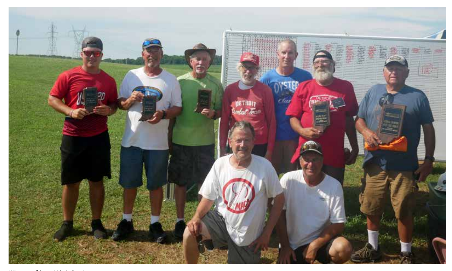
Winners of Speed Limit Combat.