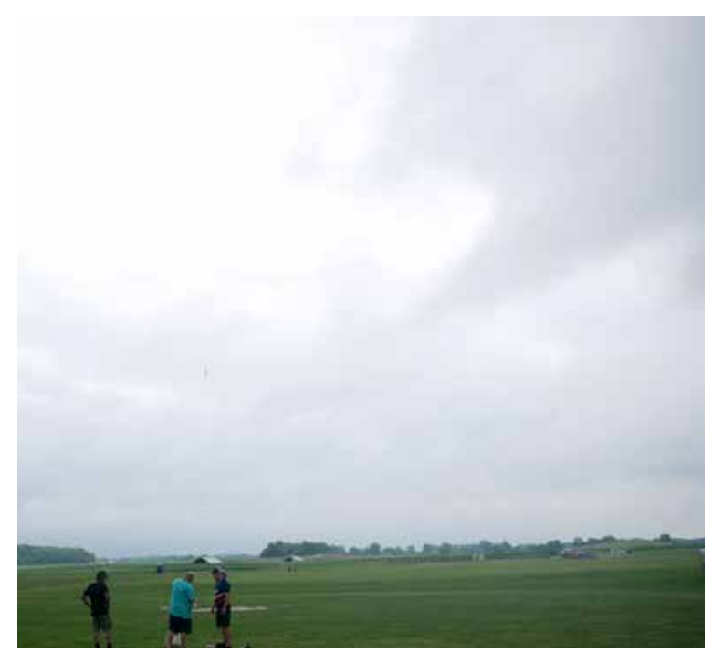
An early morning test flight.