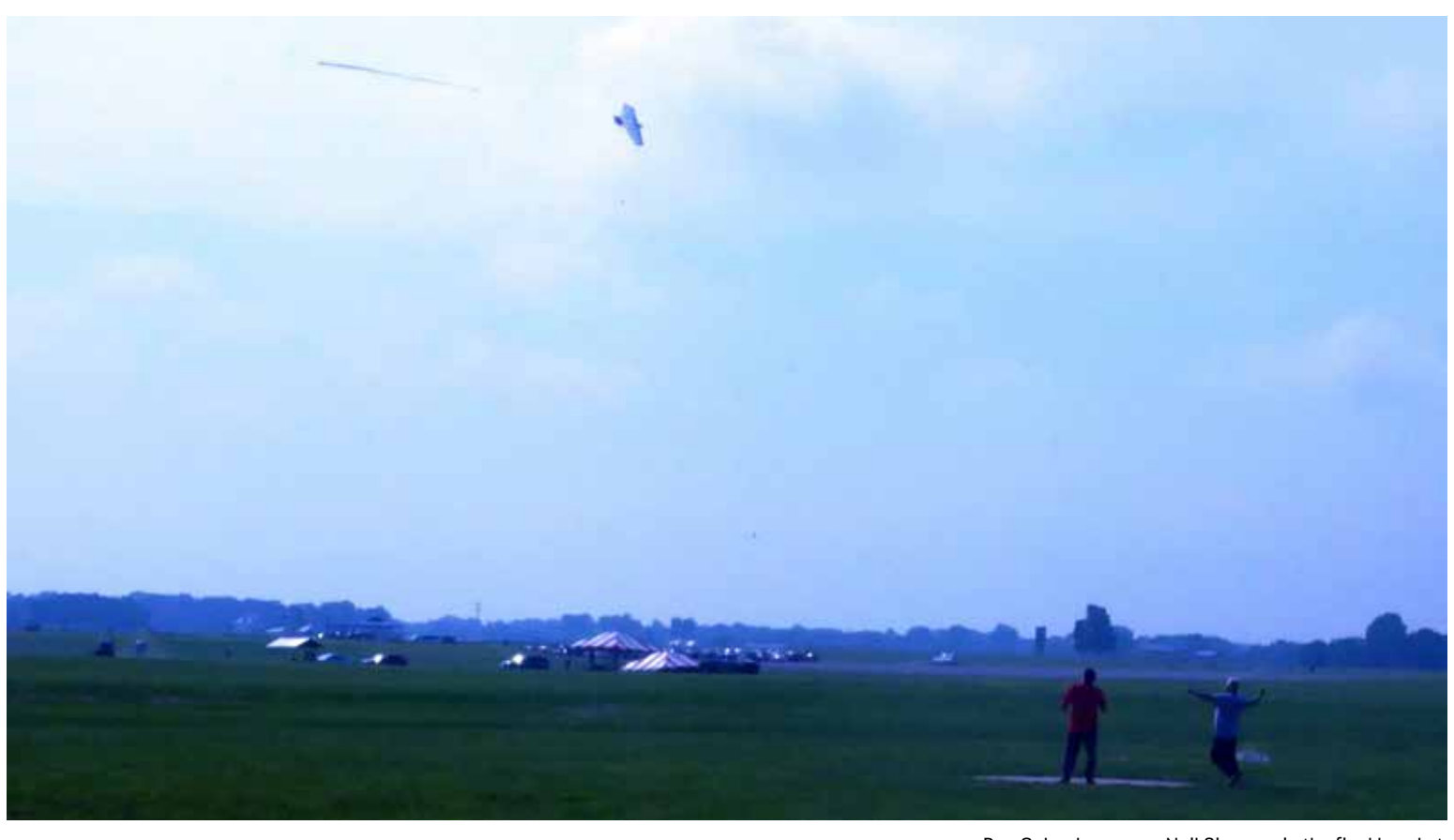
\label{lem:colombo} \textit{Ron Colombo versus Neil Simpson in the final bracket}.