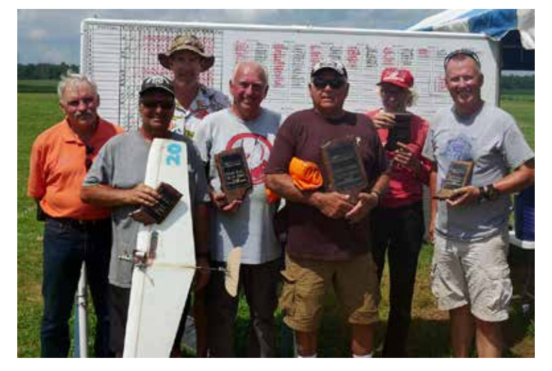
Judges and pilots.